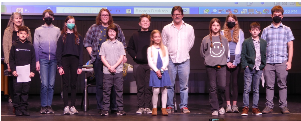
The Haiku Contest winners who attended this year's Haiku Awards Ceremony. More info on the following pages.